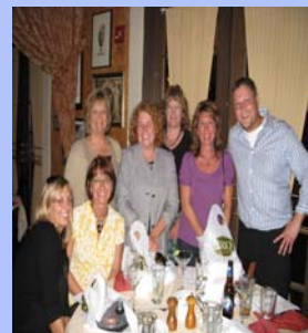
Above: Meeting Attendees

The Regional Directors have agreed to commit to hold two meetings per calendar year. Two other regions have held their first meetings, in Wisconsin and California. Other directors are in the planning phase of meeting development.